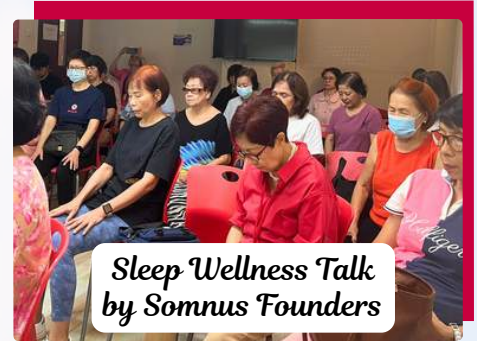
Sleep Wellness Talk by Somnus Founders